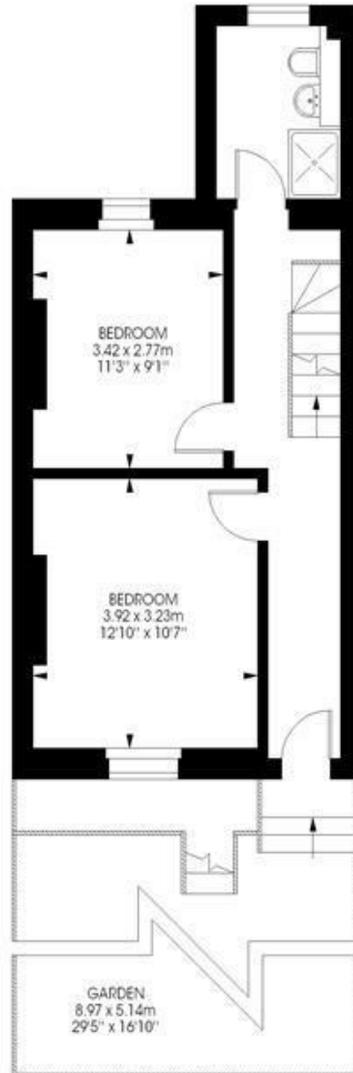
Raised Ground Floor